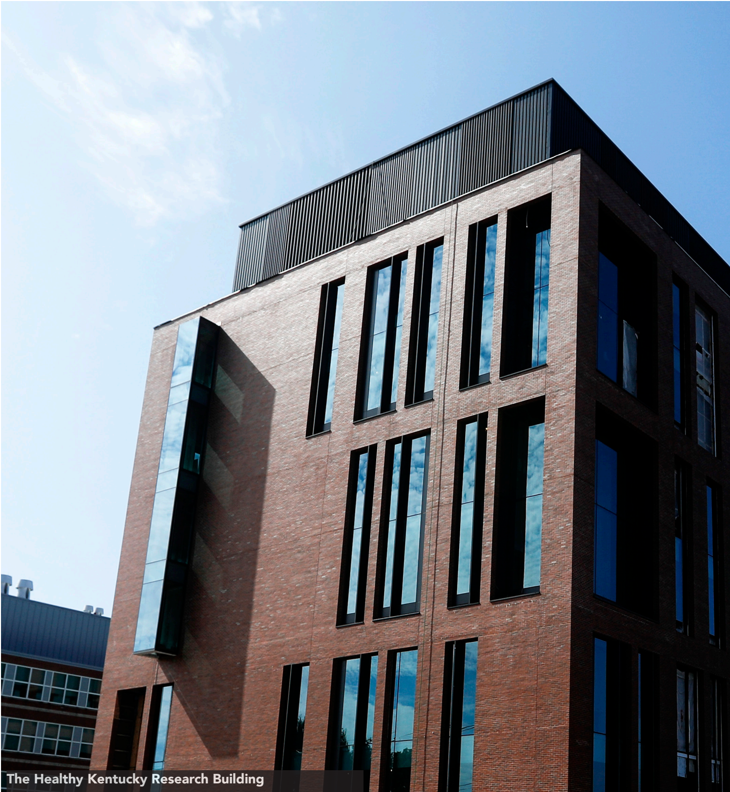
The Healthy Kentucky Research Building