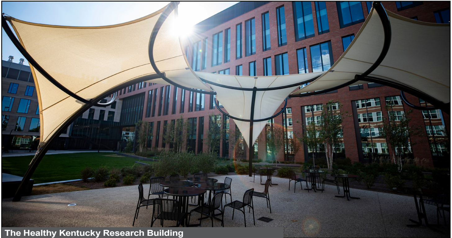
The Healthy Kentucky Research Building