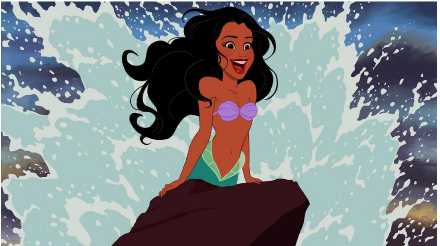
Image 1. Halle Bailey, of the R&B duo Chloe x Halle, will be starring as Ariel in the upcoming live-action adaptation of "The Little Mermaid." On July 3, Bailey wrote on Twitter and Instagram that the casting was a "dream come true," sharing an edited image of Ariel that showed her with dark skin, brown eyes and black hair.

Ariel first splashed into movie theaters nearly 30 years ago. The star of Disney's animated film "The Little Mermaid" had a certain look.