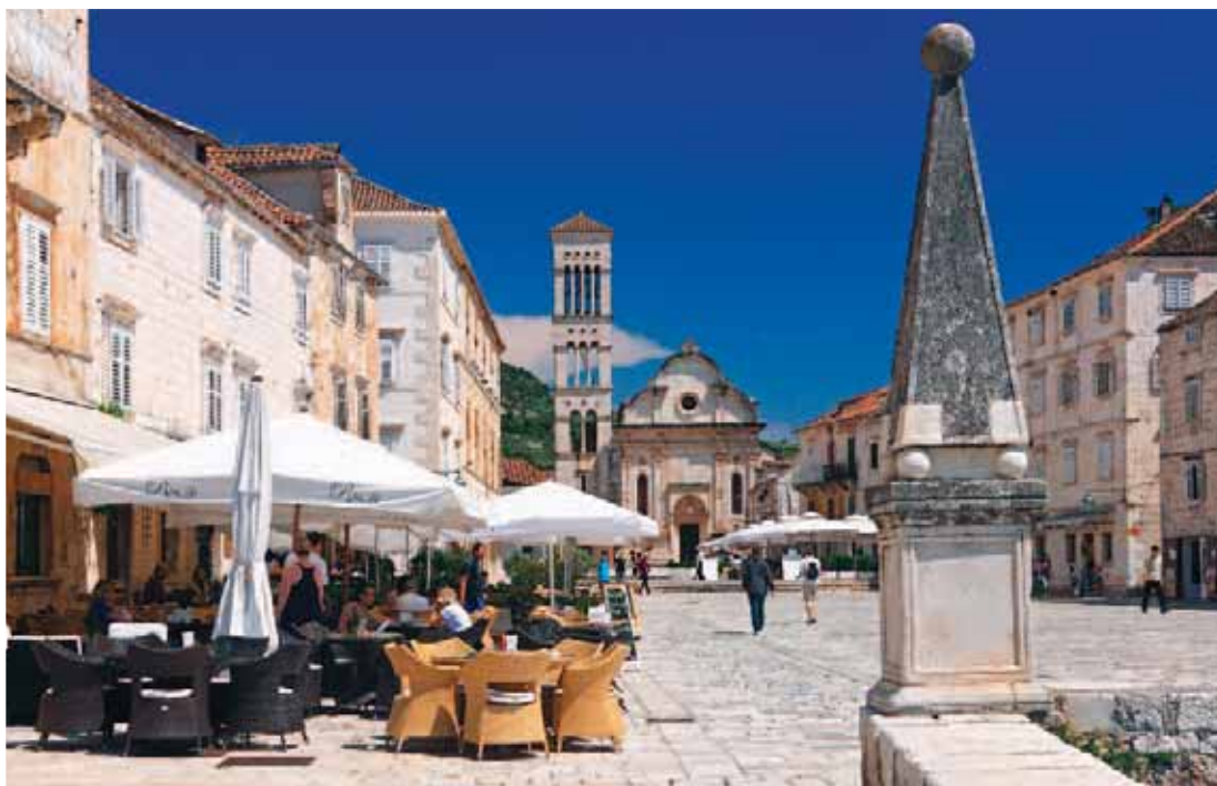
St. Stephen's Square, Hvar