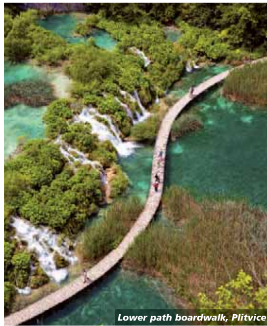
Lower path boardwalk, Plitvice

Sixteen opalescent lakes cascade from one to the next in a dramatic series of waterfalls. Miles of trails and wooden footbridges wind over, around, behind and even through the falls, immersing you in the verdant beauty of the natural wonders of this park. The constantly changing hues of the lakes — azure, brilliant green, deep blue and sometimes gray — are created by the angle of sunlight and a unique interaction between water, limestone and plant life. The travertine barriers that create the waterfalls are continually reforming, so the landscape is ever-changing. The lakes descend roughly 425 feet over five miles before flowing into the Korana River. Situated amid dense forests of beech, fir, spruce and white pine, the 115 square miles of park offers sanctuary to many animals, including black storks, endangered European brown bears and rare lynxes.