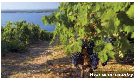
Hvar wine country