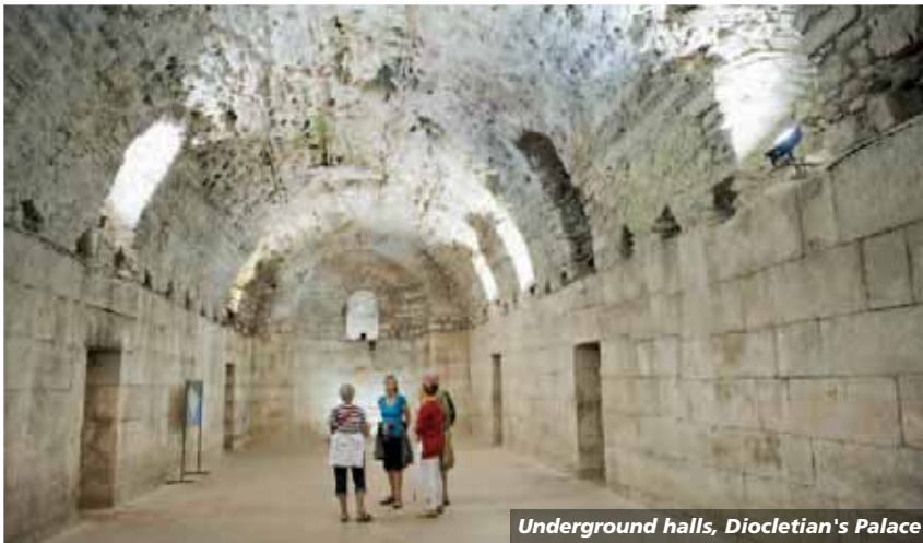
Underground halls, Diocletian's Palace