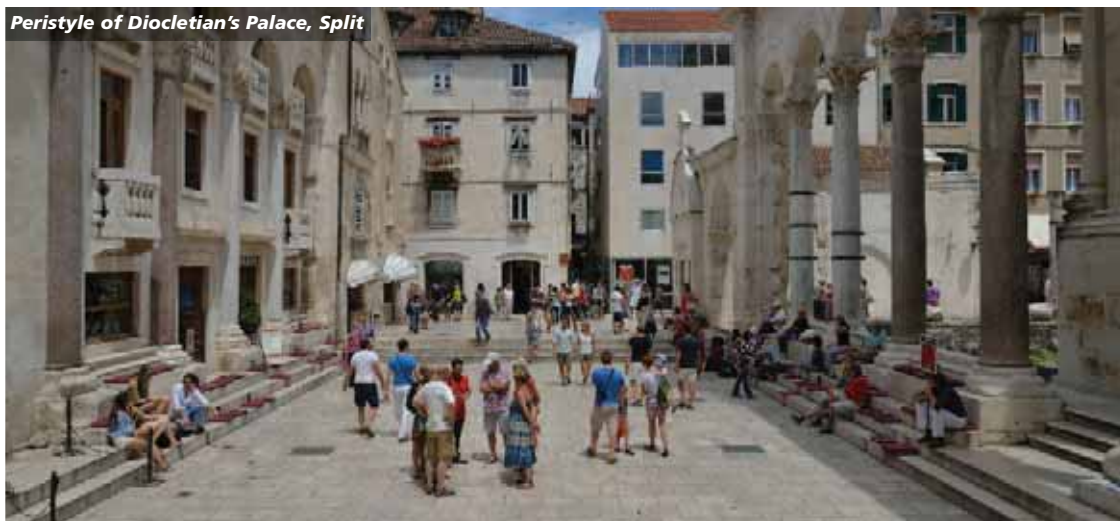
Peristyle of Diocletian's Palace, Split