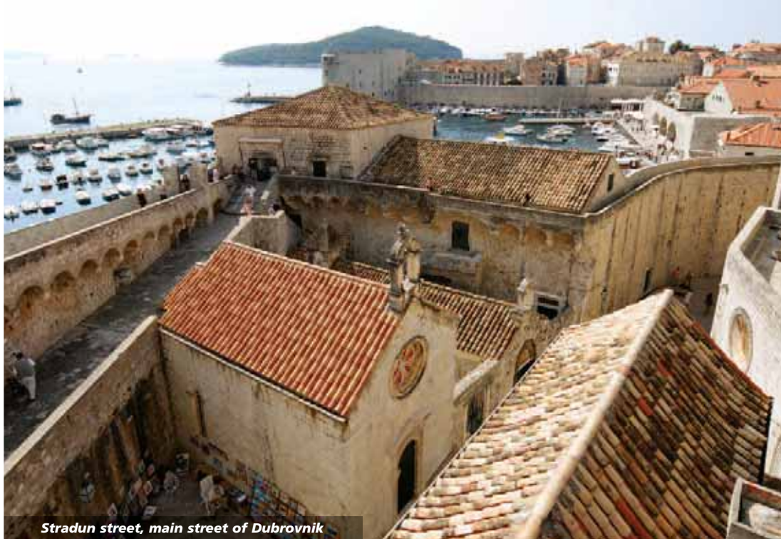
Stradun street, main street of Dubrovnik

Local Flavor: Enjoy a special Peka dinner at a country home. Peka is traditional cuisine featuring meat and vegetables roasted over hot coals under an iron bell.