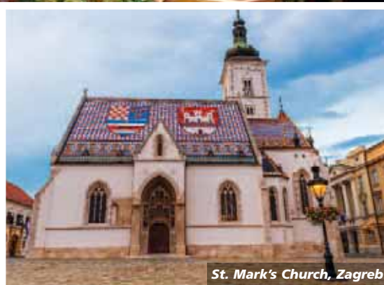
St. Mark's Church, Zagreb

Prepare to be intoxicated by Croatia's rich layers of incredible culture and staggering natural wonders. For millennia, people from all corners of the globe settled, traded and fought here, leaving their imprints on Croatia's architecture and gastronomy. Explore Croatia's treasures from Zagreb's Austro-Hungarian façades to Split's ancient Diocletian's Palace, from marbled streets to mighty medieval fortresses. Roam Plitvice Lakes National Park and witness its vividly hued lakes and waterfalls. Then succumb to the lure of Dubrovnik while strolling through the city's Old Town. Immerse yourself in Croatia, and discover the allure of this unique and captivating country.