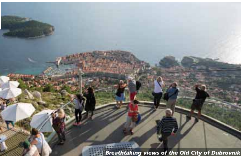
Breathtaking views of the Old City of Dubrovnik